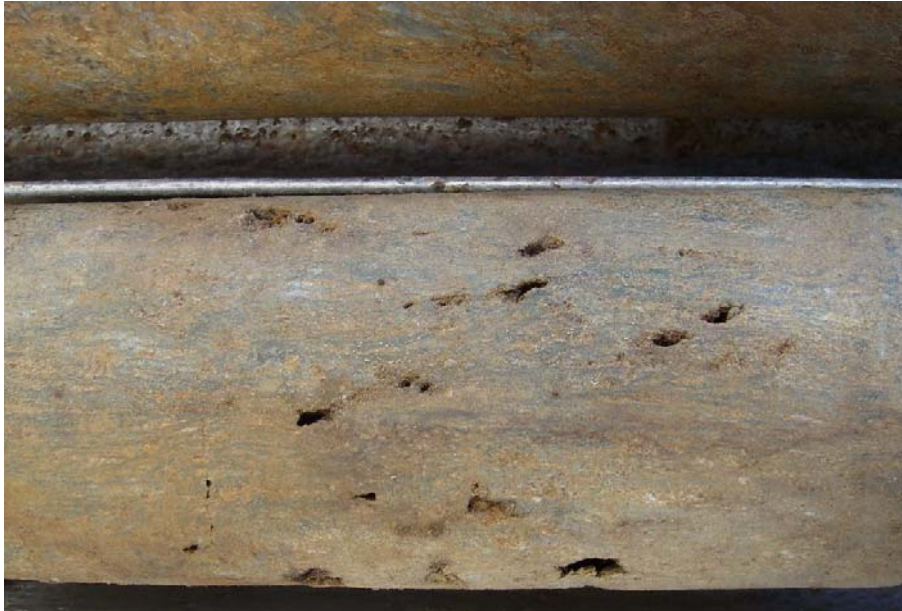
Figure 1 Layer of Gneiss Rock 49 M bgl with Small Void Spaces. This Zone is Normally Submerged in Ground Water and thus Uninhabitable for Troglofauna.