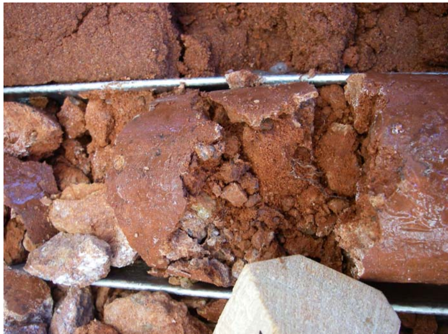
Figure 2 Interface of Saprolitic Clay and Root Mats Approx. 6 M bgl. This Layer Contains Very Small Voids Created by Roots of Surface Vegetation and thus Could Potentially be Utilised as Habitat by Troglofauna.